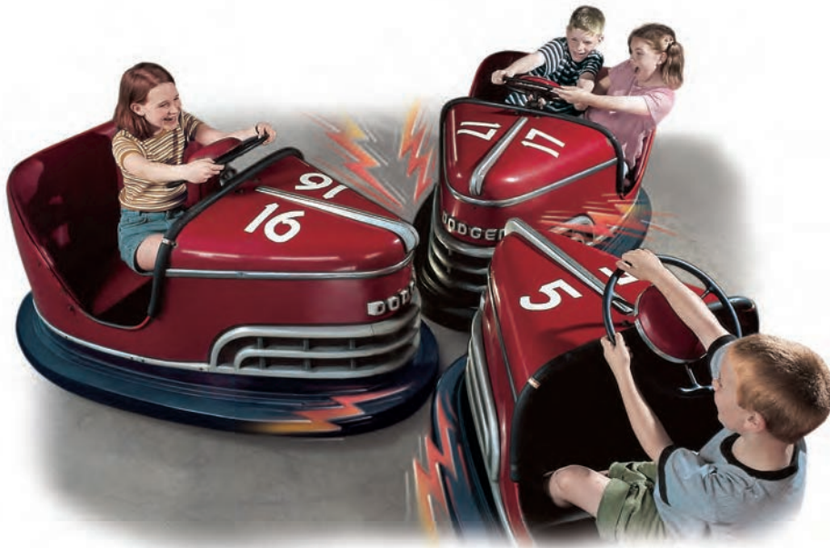
Photographed at Conneaut Lake Park, Conneaut, PA