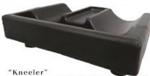
"Kneeler" W/ Bumpers 9#'s W/Casters 11#'s