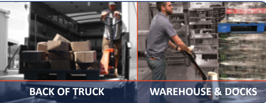
BACK OF TRUCK

The patented design of the PowerPallet 2000 locates the drive wheel within a spring loaded drive arm. A max of 350lbs is born by the drive wheel ( enough load transfer for reliable traction ), while all additional weight is born by the steering wheels of the jack. This results in less effort maneuvering at low speeds.