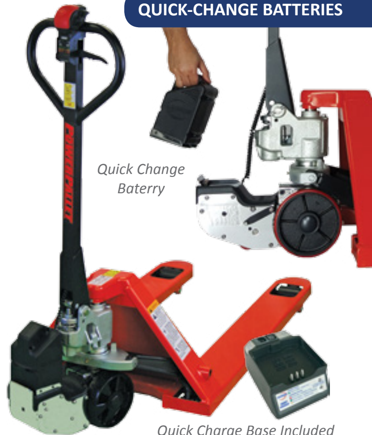
Quick Change Battery