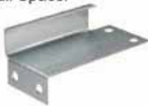
Invincible Wall Spacer