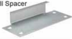
Invincible Wall Spacer