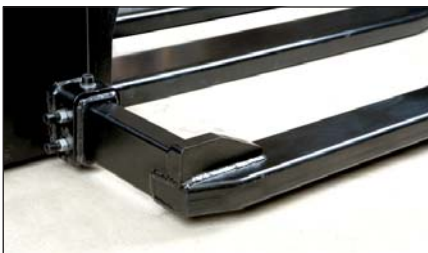
Straddle legs are user adjustable from 40" to 50" inside dimension (ID)