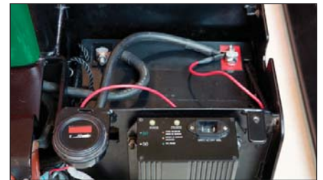
Power provided by two 12 volt, 70 amp hour batteries and onboard 110 volt charger