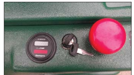
Hour meter, battery status indicator, charger controls and emergency e-stop