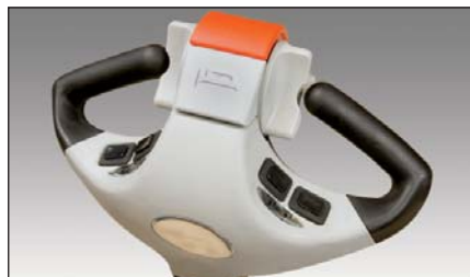
Ergonomic handle has redundant left and right hand controls and auto reversing bump switch