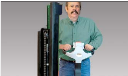
Narrow mast and offset handle provide operators with an unobstructed view