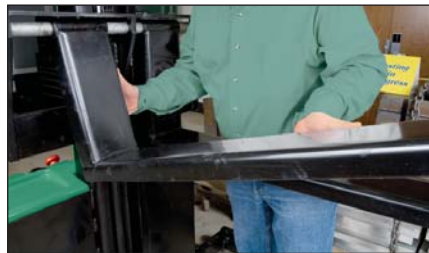
Forks on straddle models are adjustable from 12" to 27" wide